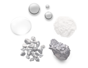
iPhone 16e | Product Environmental Report